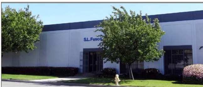
Rancho Dominguez, CA