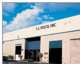
National City, CA